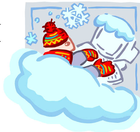
Winter Essay Writing

http://www.asq-1302.org/scholarship-1302.php